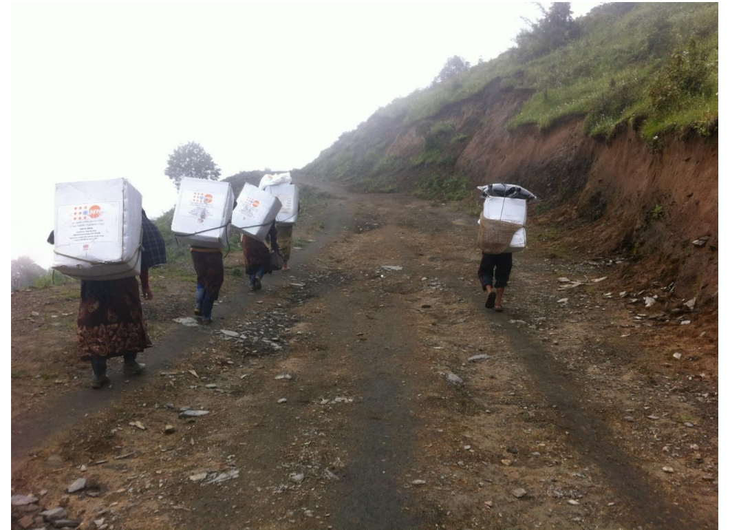
CARE Nepal, Delivering RH Kits